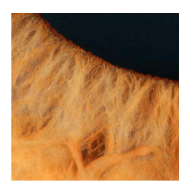
Complete differentiation of gastrointestinal iris signs will be made via lavish imagery

Some of the most prevalent conditions & symptoms that we can encounter are those involving the Gastrointestinal System. Combining modern iridology & tongue analysis can provide clarification and help to understand the foundation to any digestive problems. This seminar will combine classical topography & the latest gastrointestinal iridology research to explore the dynamic interactions of the liver, endocrine & immune systems, embryology & emotional dynamics in many different gastrointestinal conditions. Successful treatment protocols for a myriad of digestive symptoms from John's extensive clinical experience will be covered from around the world.